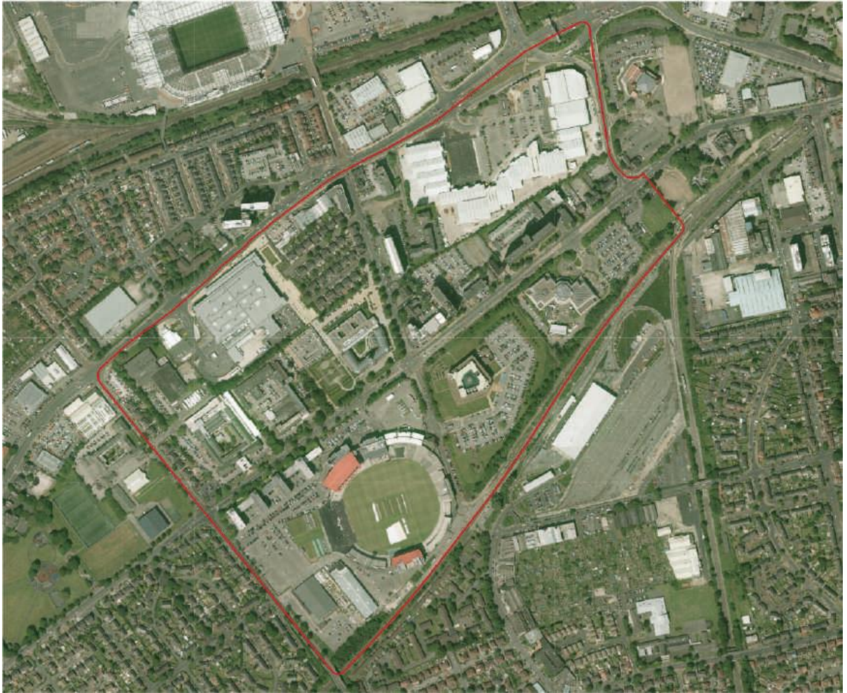
Figure 1.2: Location of the Trafford Civic Quarter Masterplan Area Aerial View 13